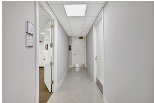
Corridor access to back doors