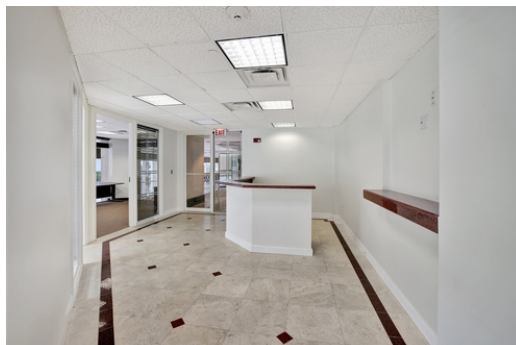
Unit Reception Area