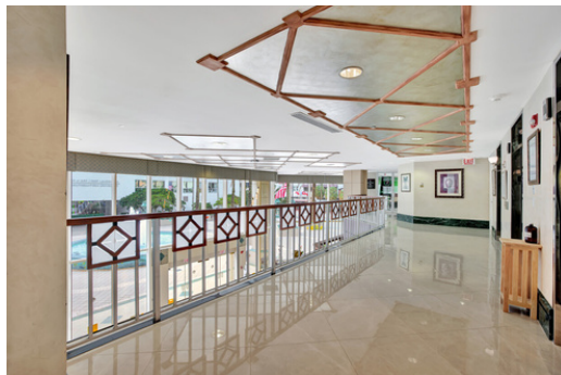
Unit Mezzanine Entrance