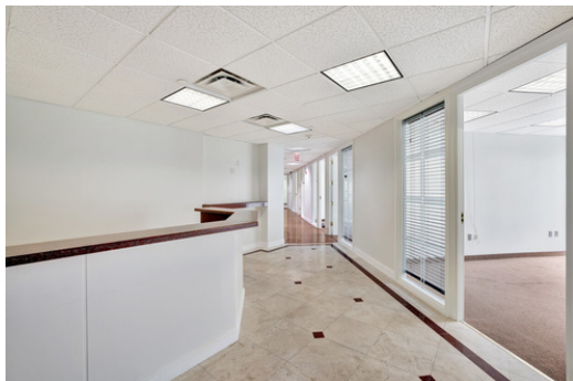
Unit Reception Area