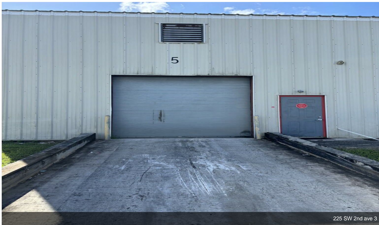
225 SW 2nd ave 3