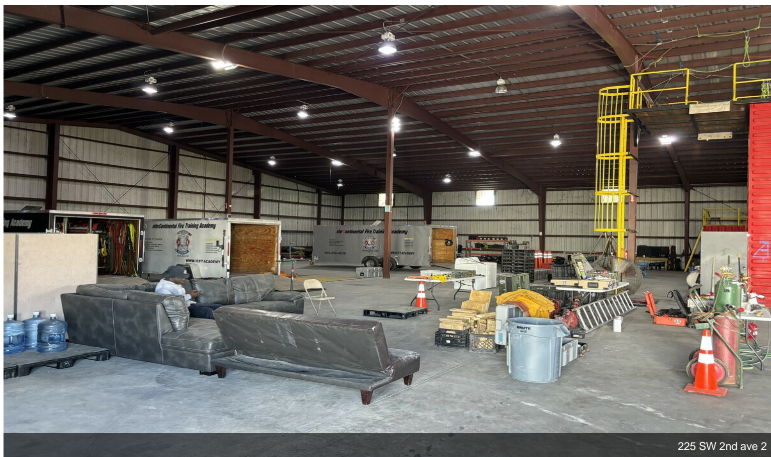
225 SW 2nd ave 2