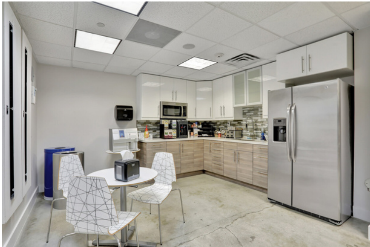
Kitchen / Break room 2