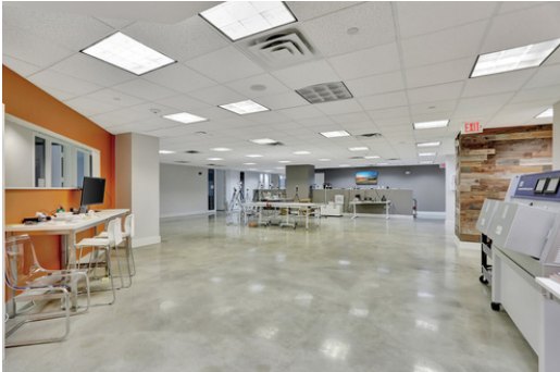
Open Space Working Area