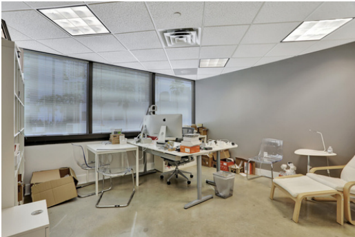
Sample Private Office