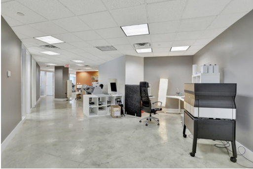
Open Space Working Area