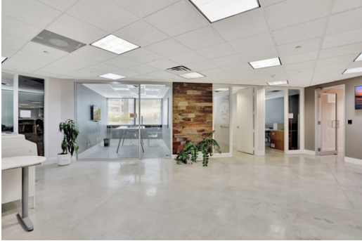
Open Space Working / Relaxing Area