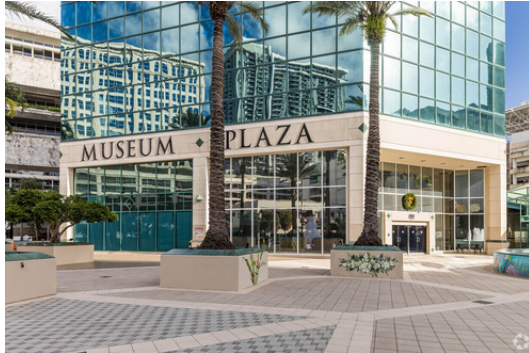
Museum Plaza Courtyard