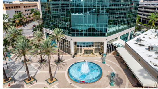
Museum Plaza Courtyard