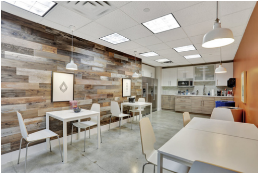
Kitchen 1 Area