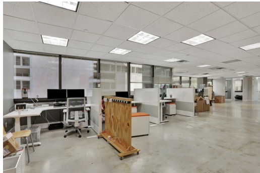
Open Space Working Area