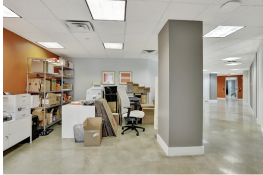
Open Space Working stations