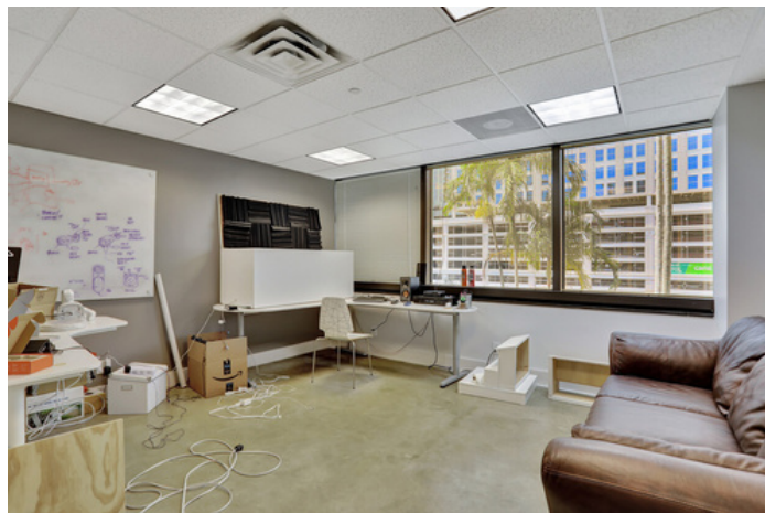
Open Space Working Area