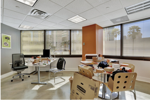
Sample Private Office