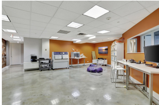
Open Space Working Area