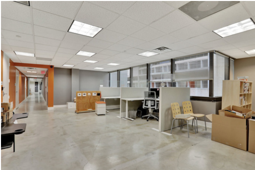
Open Space Working Area