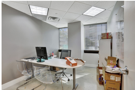
Sample Private Office