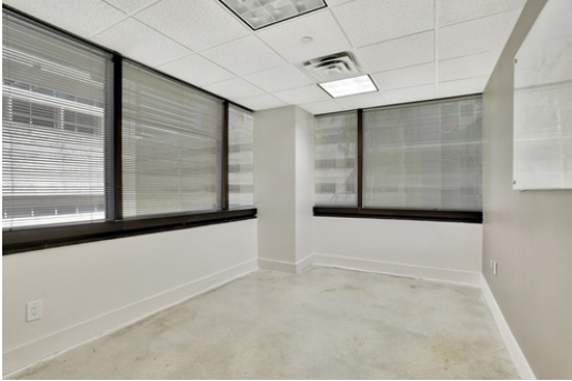
Sample Private Office