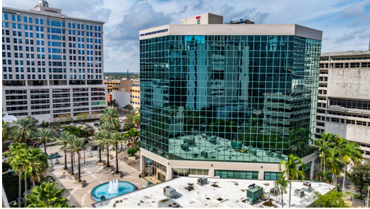
Museum Plaza Building