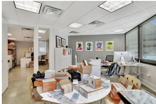
Sample Private Office