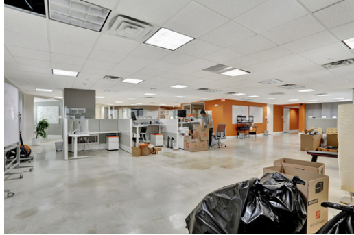
Open Space Working Area