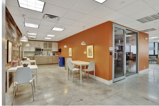
Kitchen 1 Area