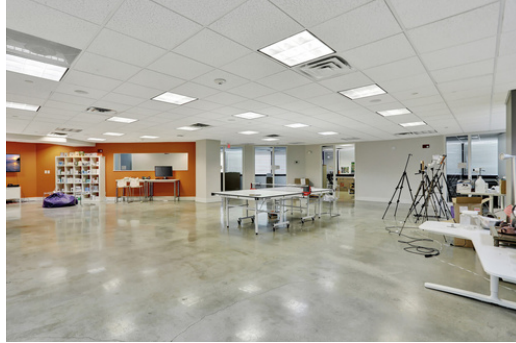
Open Space Working / Relaxing Area