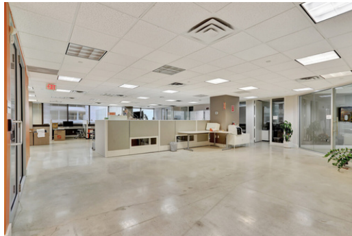
Open Space Working / Relaxing Area